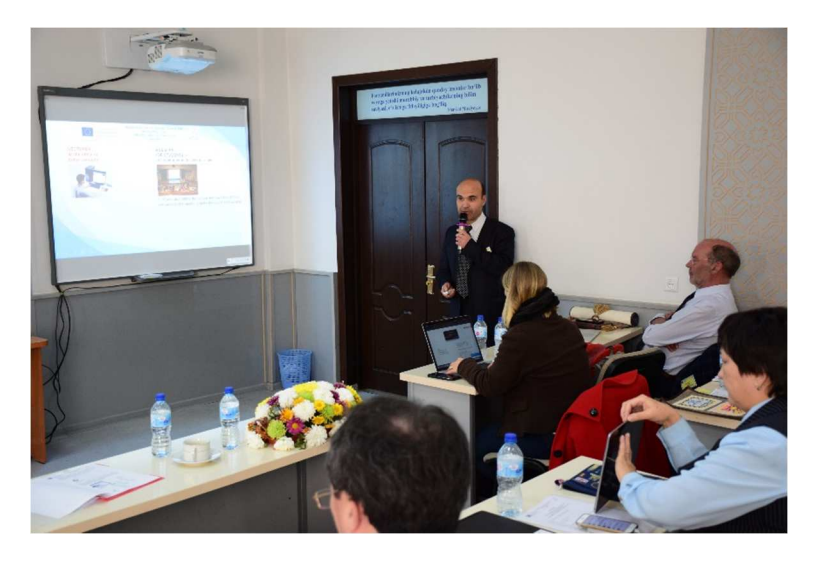
Practical exercise 3: How to use videoconferencing