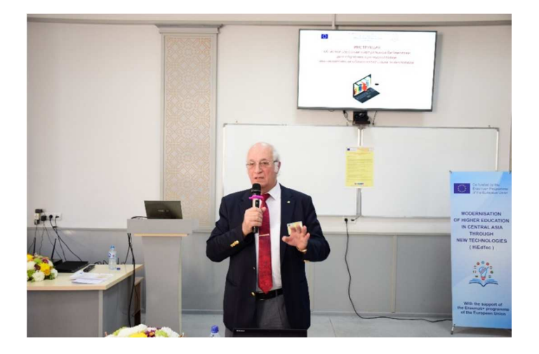
Visit to the Tashkent State University of Economics Visit to the Museum of the University